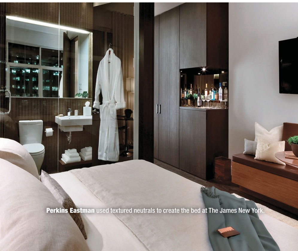
Perkins Eastman used textured neutrals to create the bed at The James New York.

AMANDA SULLIVAN STUDIO ARCHITECTURE/PERKINS EASTMAN