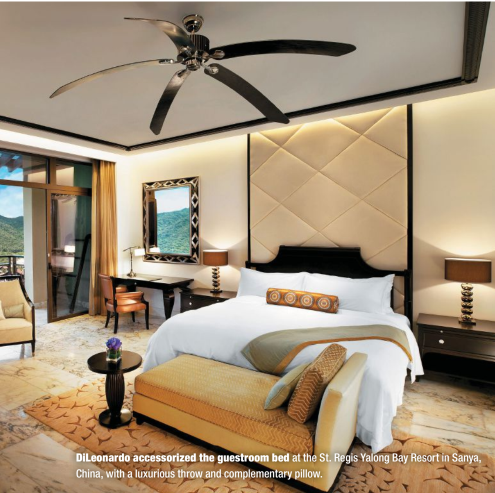
DiLeonardo accessorized the guestroom bed at the St. Regis Yalong Bay Resort in Sanya, China, with a luxurious throw and complementary pillow.